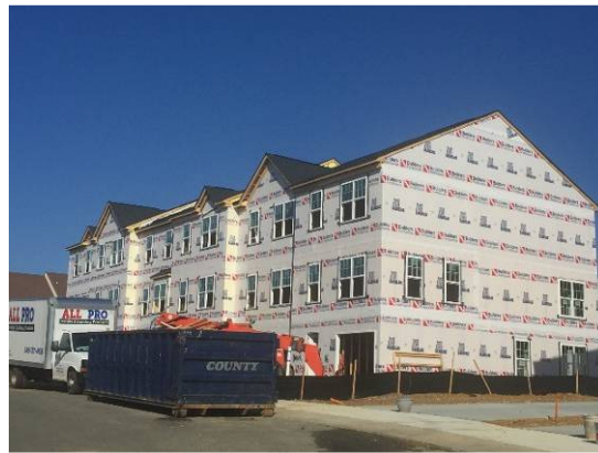
Townhomes at Lakeside (UC)