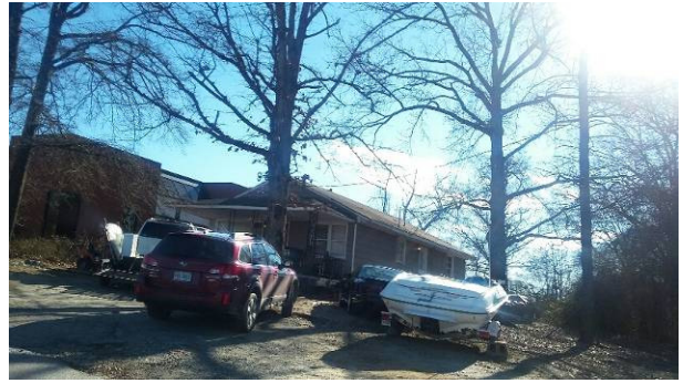
View into Site with Existing Home