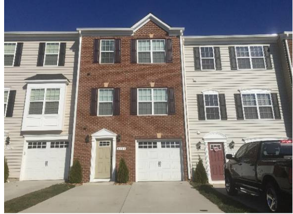
Townhomes at Lakeside