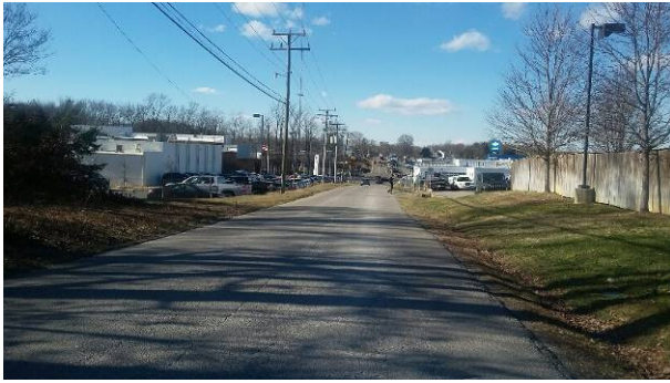
View of Hudgins Road West