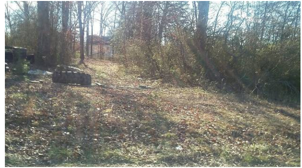
View to rear of Site

The site has a vacant home and is nearly fully wooded. It is located on the south side of Hudgins Road. Hudgins Road at this location is a mix of mature single family homes and commercial/light industrial uses. To the west of Route 1, Hudgins Road is the location of a new single family and townhome subdivision – Summerfield. The recently sold out Lafayette Crossing is located east of the study site, but also nearby.