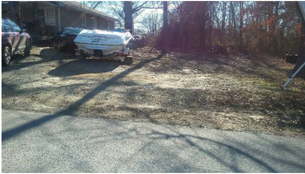
Additional View into Site