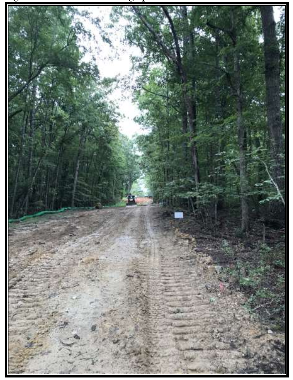
Figure 4: View East – Facing Spotswood Furnace Road

This photo is taken from the edge of the proposed facility facing east towards Spotswood Furnace Road along the existing gas easement. The proposed facility is setback 625' from Spotswood Furnace Road. Given significant setback and dense vegetation, the visual impact of the proposed facility will be almost nonexistent.