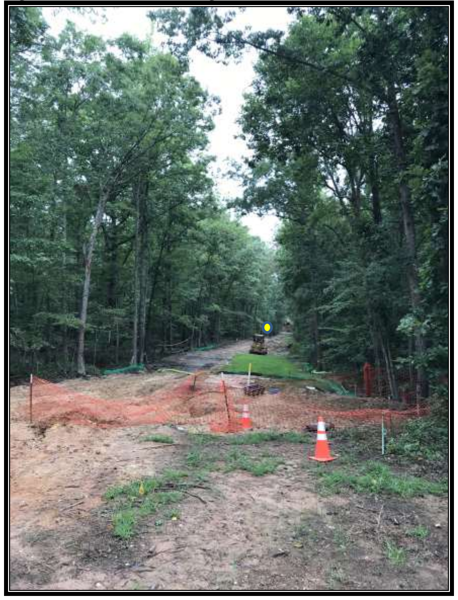
Figure 5: View West – Facing the PIG site

This photo is taken from the edge of the gas easement adjacent to the residential lot to the north. The approximate location of the facility is identified with the yellow dot. From this location the facility is approximately 350' away. With the existing dense vegetation, the visual impact from the residence is non-existent. Standing at this location is approximately 100' from the residence and from this perspective one could see the slatted fence in the distance.