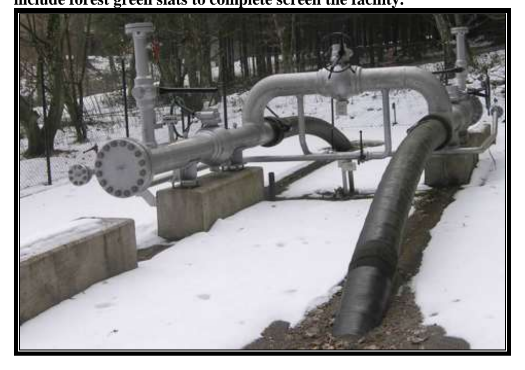
Figure 3: PIG Launcher Site aboveground piping – Please note, proposed fencing will include forest green slats to complete screen the facility.